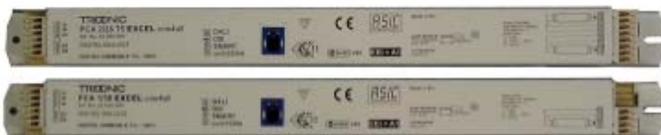
electronic ballasts for single and dual tube operation: available for flourescent tubes 18W / 36W / 58W in T8 format 1nd 14W / 21W / 28W / 39W in T5 tube format

Installation of electronic ballasts must only be carried out by trained and qualified technicians. Electronic ballasts must be connected to mains voltage; interchanging power supply and control lines will damage both, ballast and booster. Check your wiring thoroughly before powering up your system.