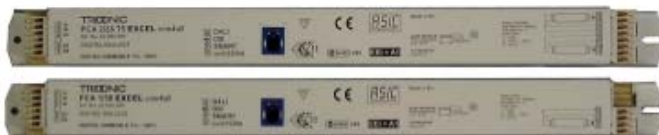
electronic ballasts for single and dual tube operation: available for flourescent tubes 18W / 36W / 58W in T8 format 1nd 14W / 21W / 28W / 39W in T5 tube format

Installation of electronic ballasts must only be carried out by trained and qualified technicians. Electronic ballasts must be connected to mains voltage; interchanging power supply and control lines will damage both, ballast and booster. Check your wiring thoroughly before powering up your system.